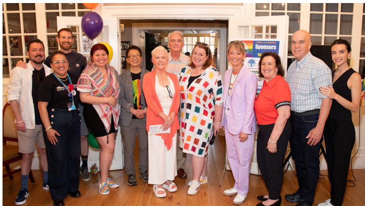
2024 GLCF LGBTQ+ fund benefit brunch inside Cobblestones Restaurant in Lowell on June 15, 2024.